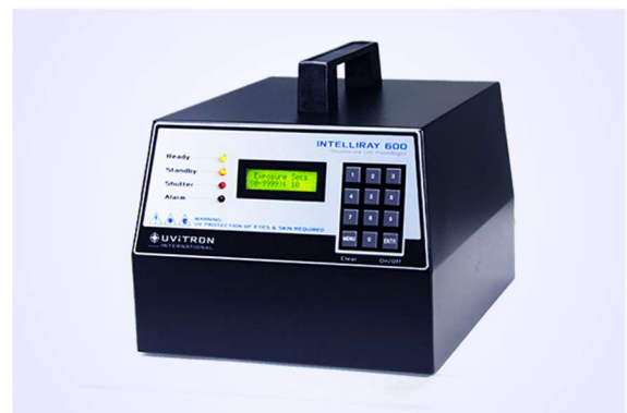
IntelliRay lamp head

The unit automatically reduces lamp power by one half when the shutter is closed. This reduces excessive heat and therefore increases life of system components, without the need to power down.